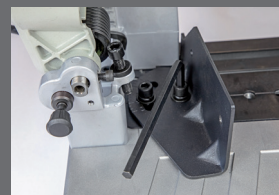
adjustable angle stop