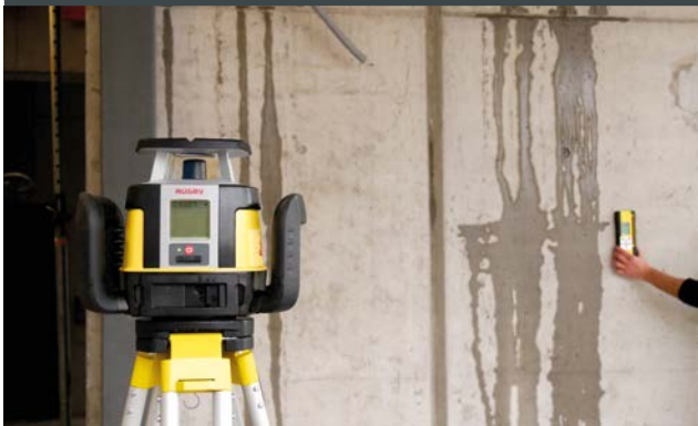
HORIZONTAL ONE-BUTTON LASER